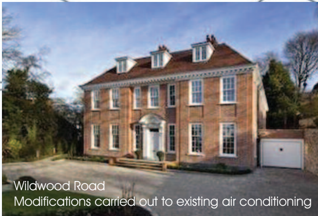
Wildwood Road Modifications carried out to existing air conditioning

Offering solutions to manufacturing, production areas, offices, commercial property and local government.